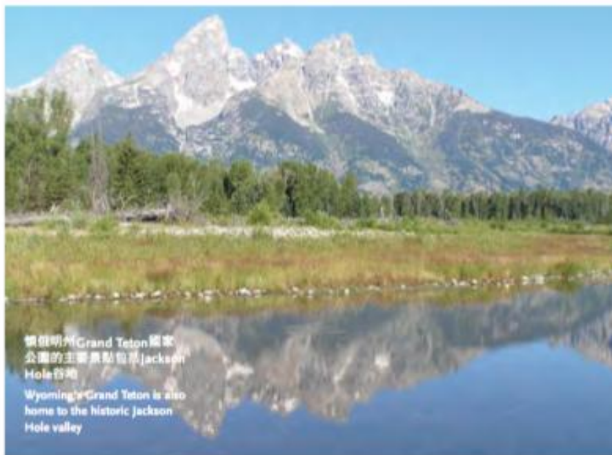
懷俄明州Grand Teton國家公園的主要景點包括Jackson Hole谷地 Wyoming's Grand Teton is also home to the historic Jackson Hole valley